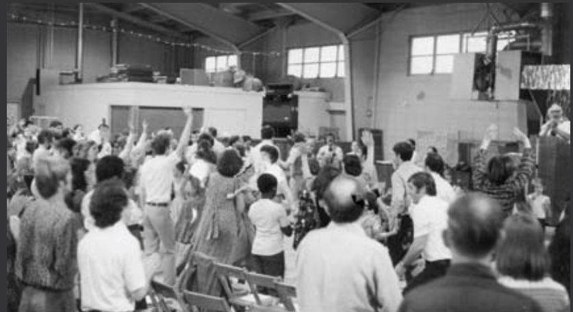
Top left: Dancing at a wedding reception in the LaSalle Building, 1978. Top right: Dancing at the conference in Rome, 1975. Left and right: Dancing in South Bend, 1977, following a covenant ceremony for brothers and sisters who had just moved from San Francisco to join the People of Praise.